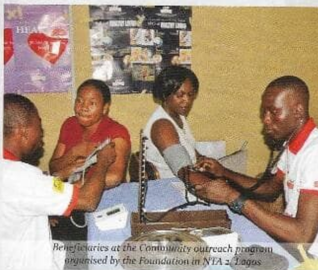
Beneficiaries at the Community outreach program organised by the Foundation in NTA 2, Lagos

• COF and EMZOR team attended Ideato North, L. G. A, Imo State Diocesan Women Conference with free