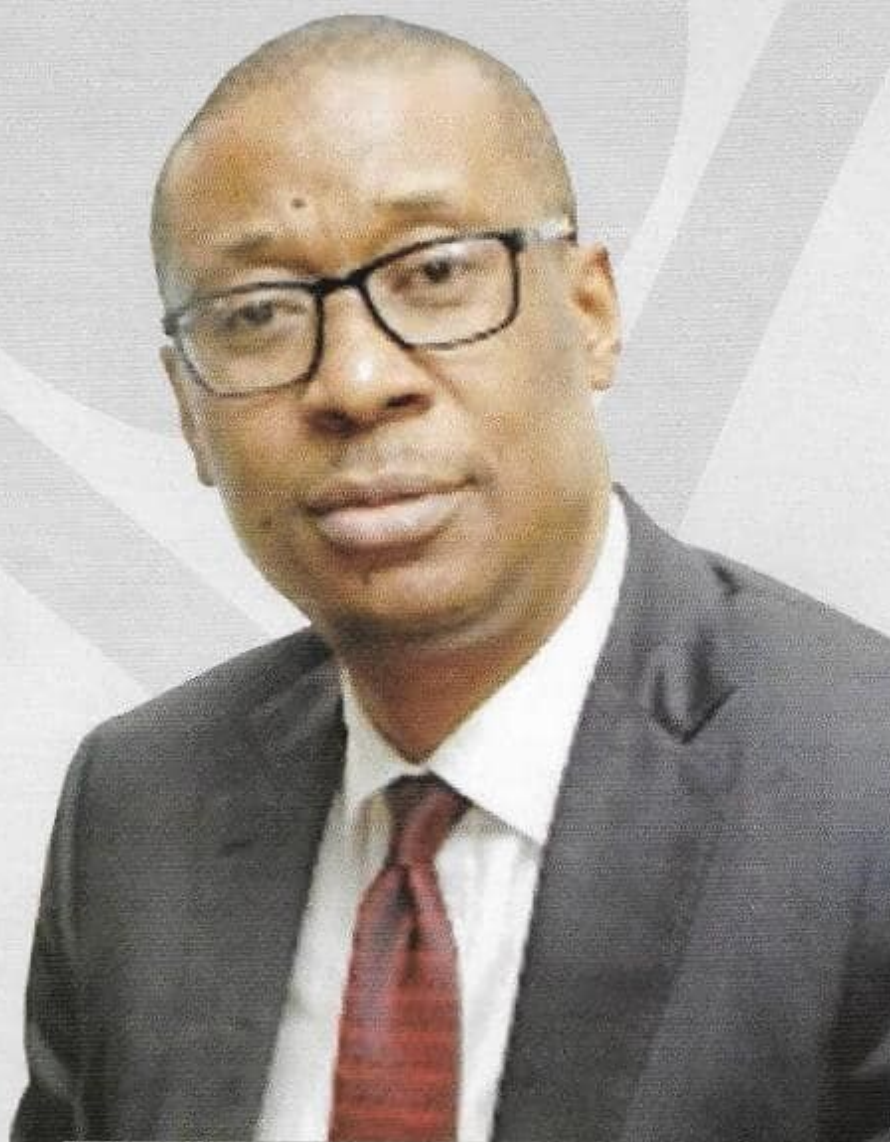
Professor Okechukwu Enelamah

Honourable Minister of Industry, Trade and Investment, Federal Republic of Nigeria