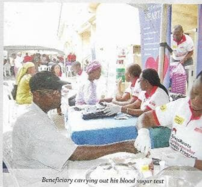
Beneficiary carrying out his blood sugar test