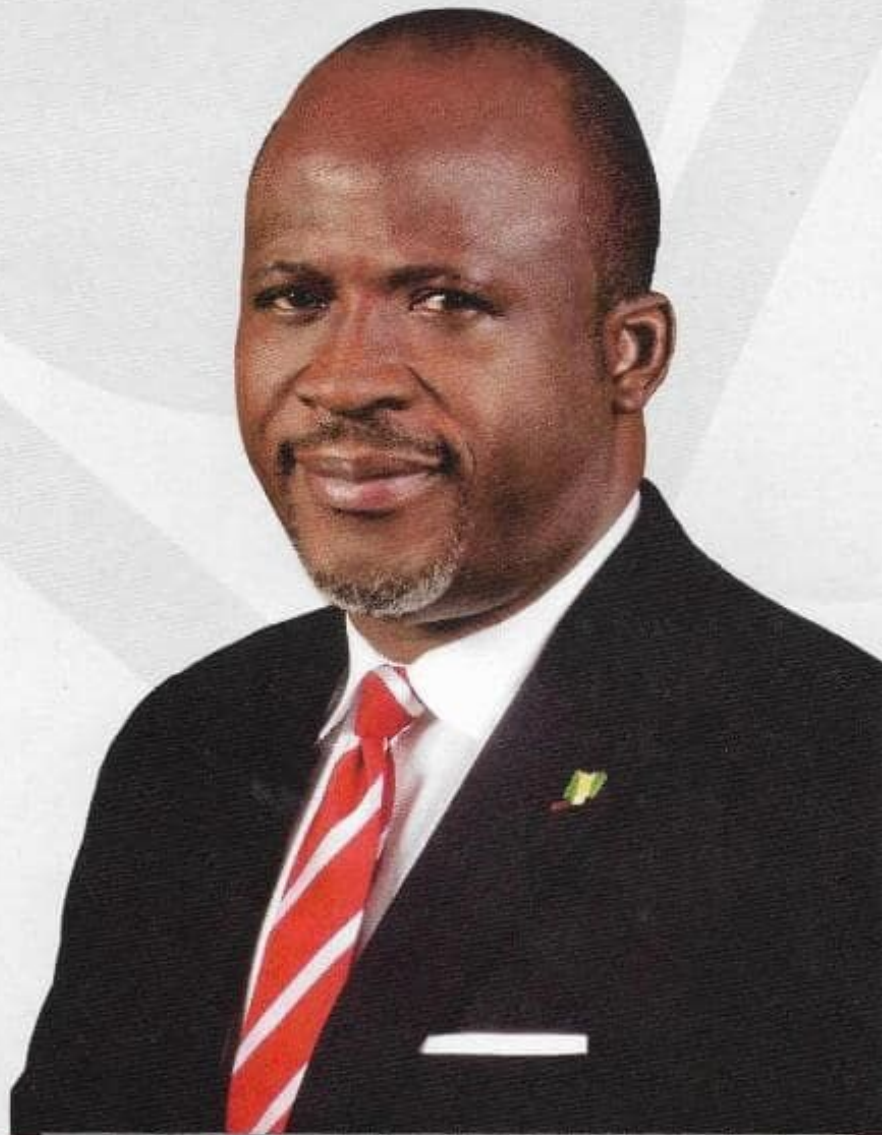
Engr. Akin Olateru

Commissioner/CEO, Accident Investigation Bureau (AIB)