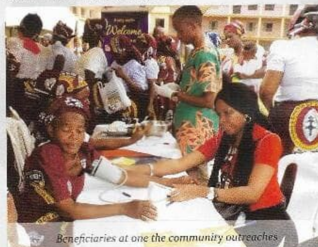
Beneficiaries at one the community outreaches

The Foundation will continue to pursue the ideals for which it was set up, with even more passion and commitment in the years ahead.