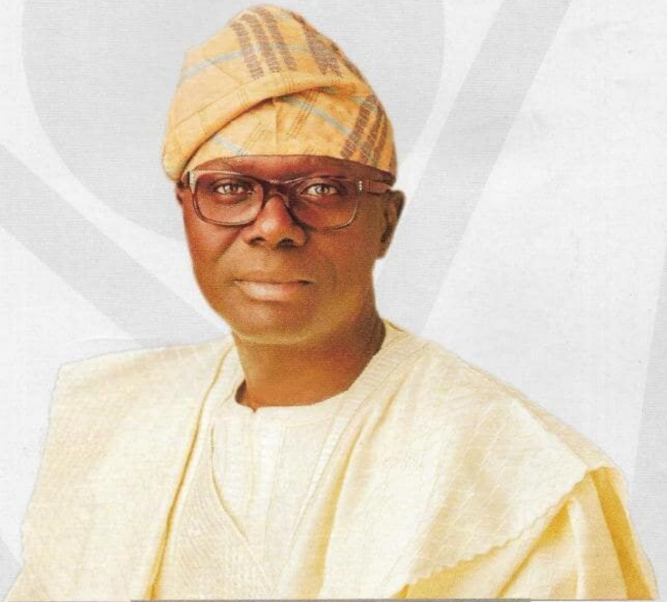
His Excellency, Babajide Sanwo-Olu Executive Governor of Lagos State