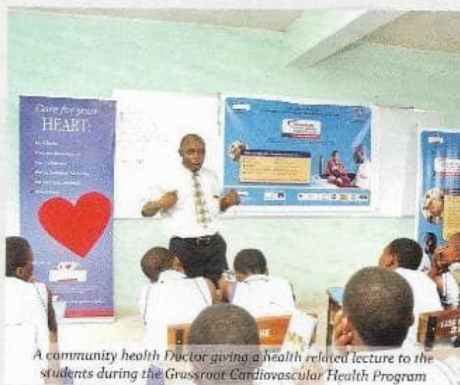
A community health Doctor giving a health related lecture to the students during the Grassroot Cardiovascular Health Program

collaboration with Goldcrest and supported by Emzor, Synlab (Formerly PathCare) and Fidelity Bank to mark the World Heart Day. The primary aim of the program is to provide free healthcare services and inform people on the risk factors associated with cardiovascular disease.