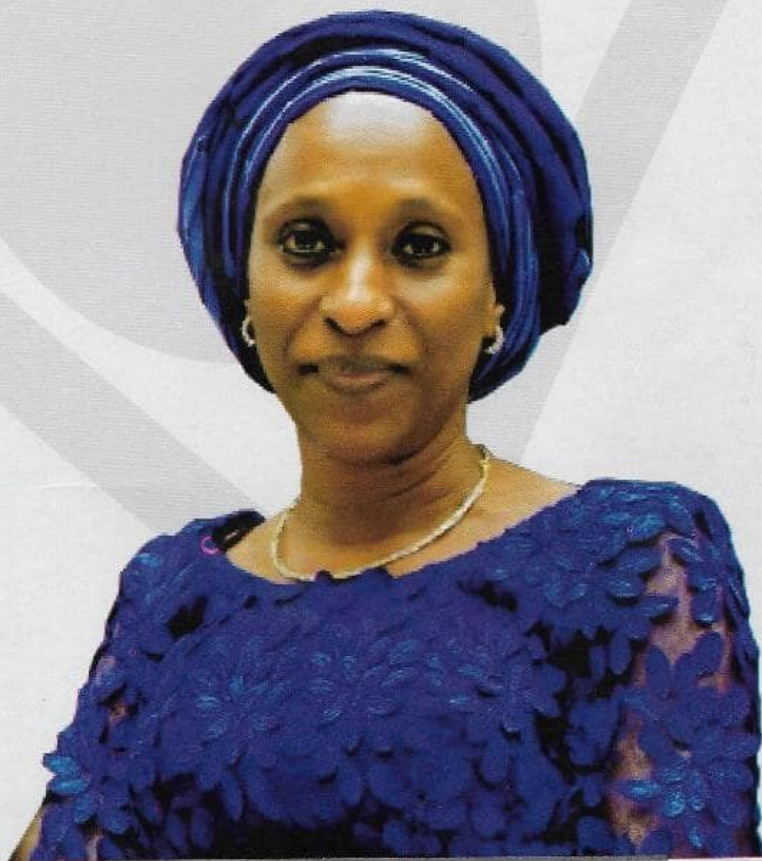
Her Excellency, Mrs. Dolapo Osinbajo Wife of the Vice President, Federal Republic of Nigeria