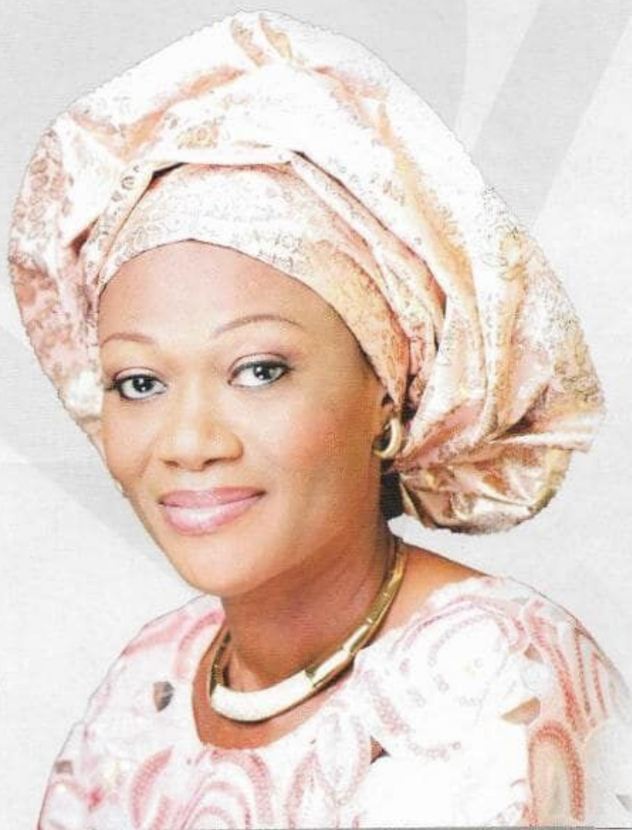
Her Excellency, Senator Chief (Mrs) Oluremi Tinubu, OON Distinguished Senator of the Federal Republic of Nigeria, President New Era Foundation