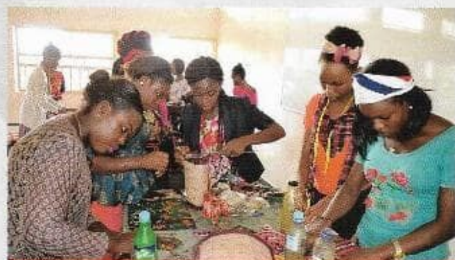
Students of COCES at work

This kitchen was opened in January, 2018 to offer catering services to the university community on the