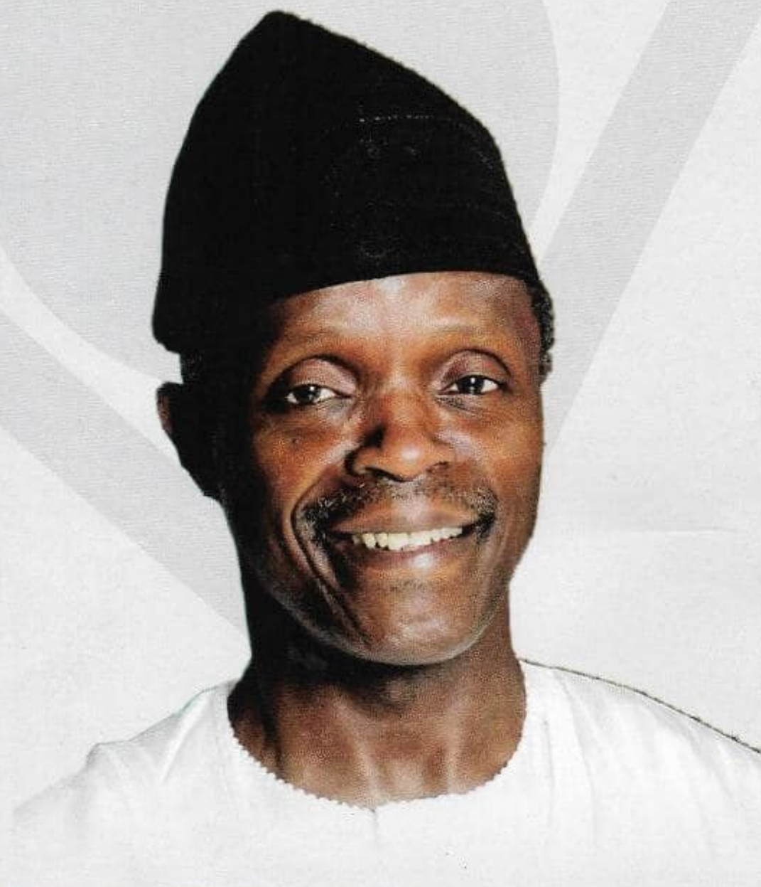
His Excellency, Professor Yemi Osinbajo, SAN, GCON Vice President, Federal Republic of Nigeria